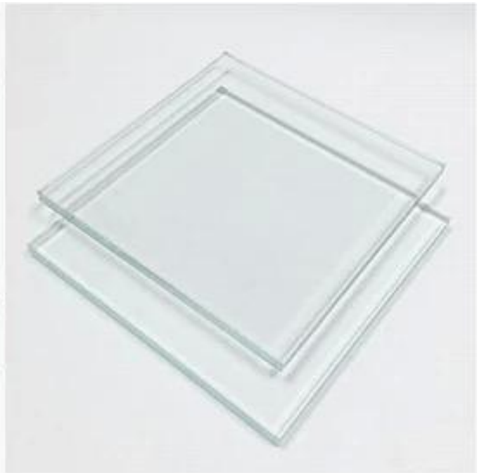
Ultra Clear Tempered Glass