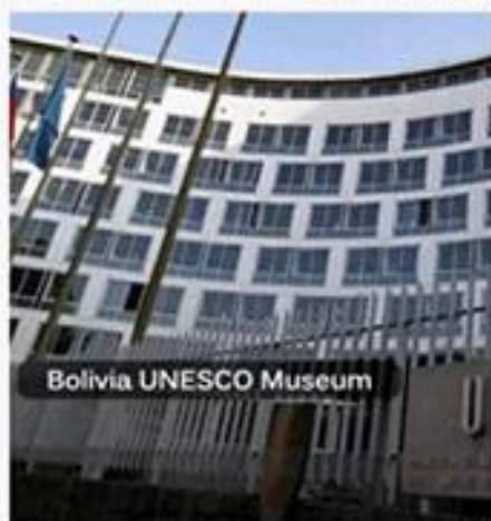
Bolivia UNESCO Museum