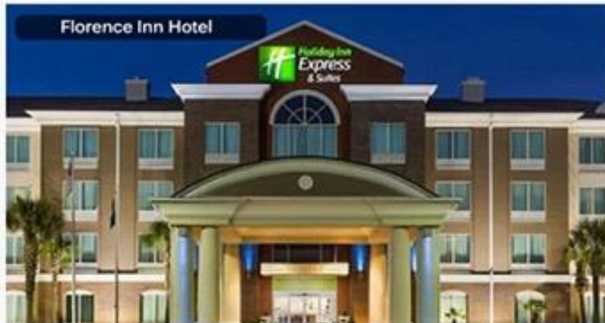
Florence Inn Hotel