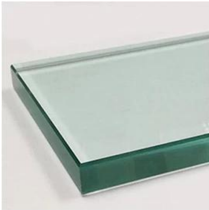
Clear Tempered Glass

3. The visible light transmission of ultra clear tempered glass is higher than clear tempered glass, its transmittance of visible light is more than 91.5%.