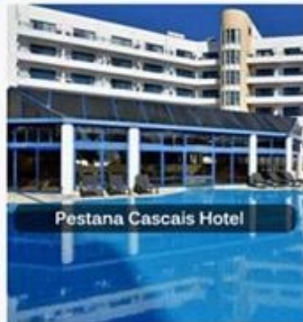
Pestana Cascais Hotel