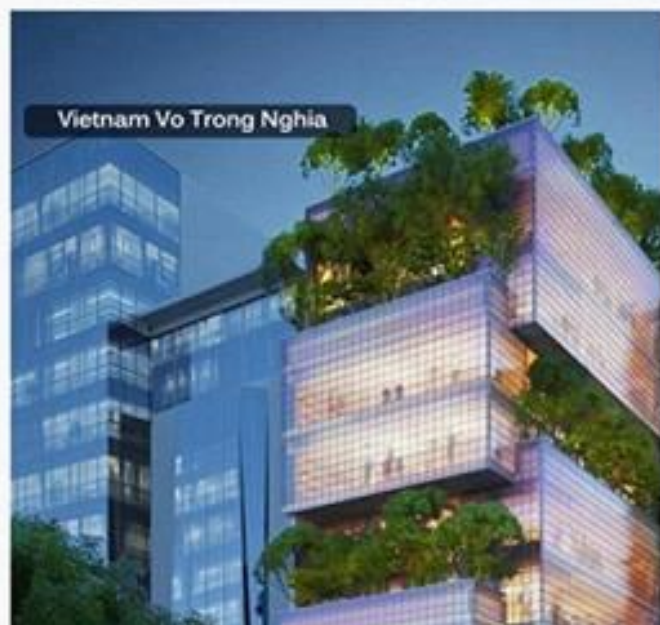
Vietnam Vo Trong Nghia