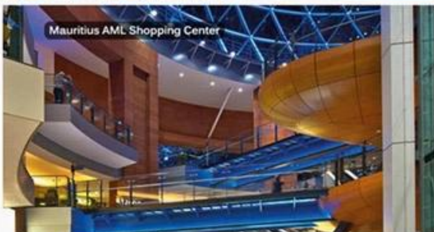
Mauritius AML Shopping Center