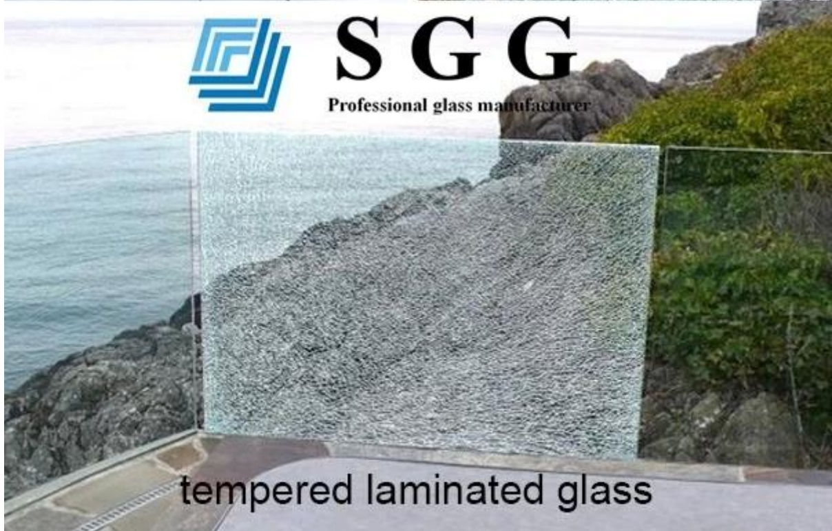
tempered laminated glass