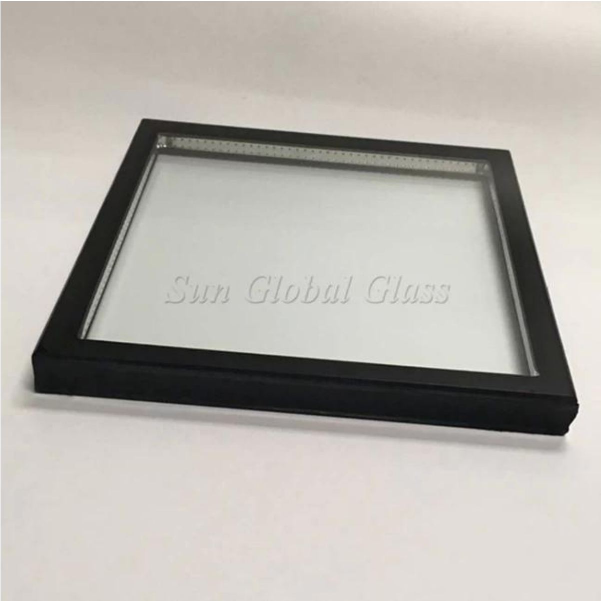
Ultra Clear Toughened Double Glazing Units Production Line: