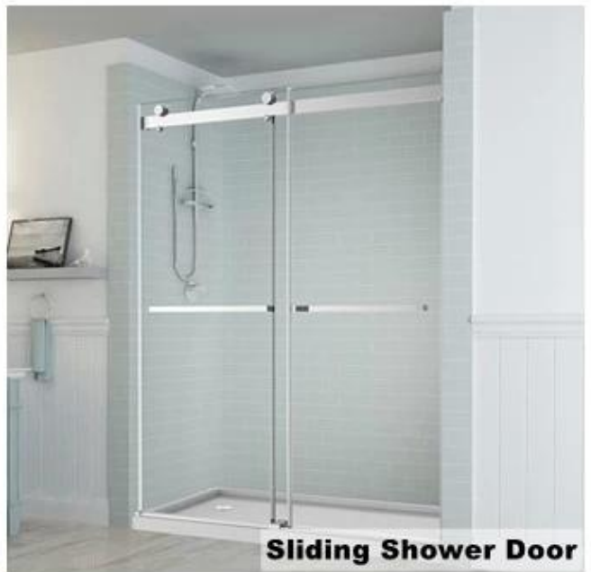
Sliding Shower Door