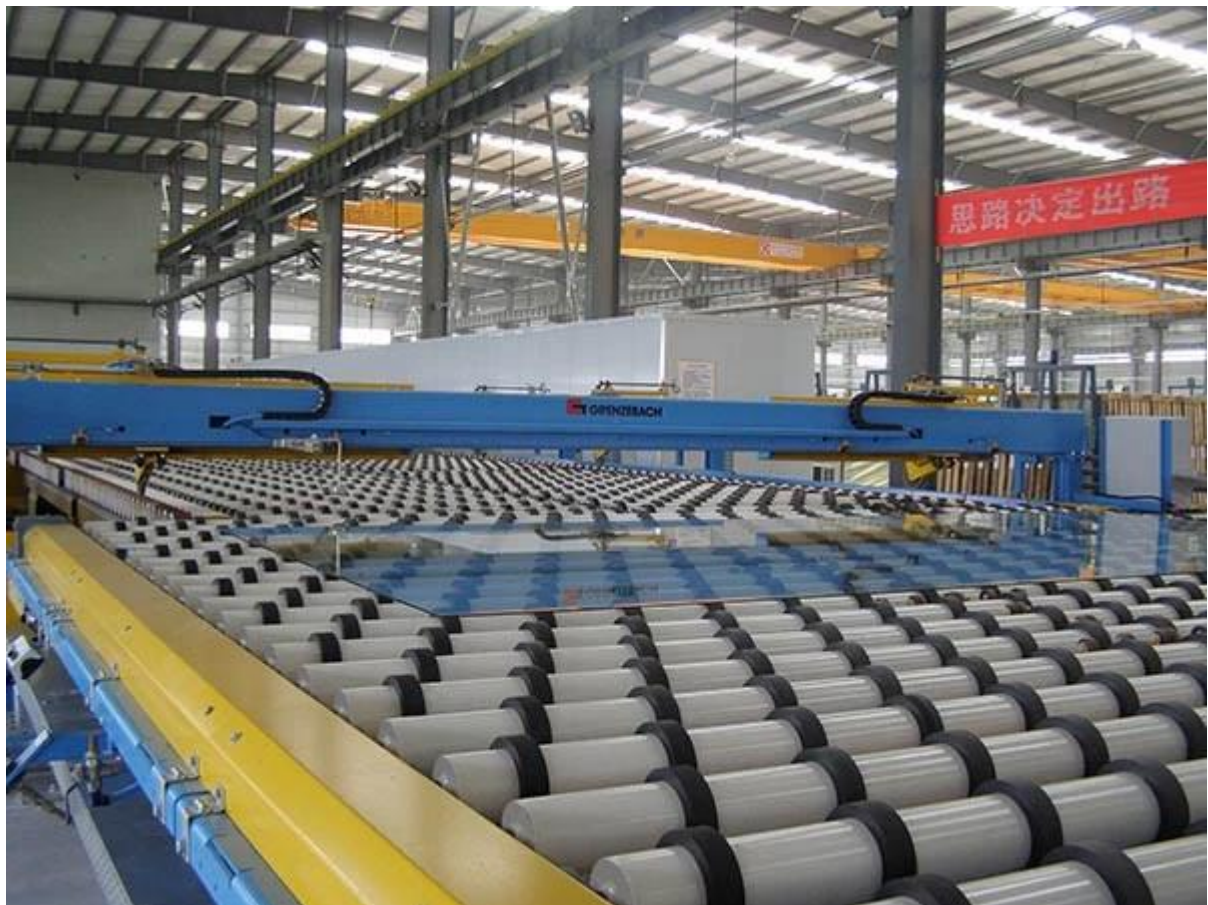
Package and Loading: