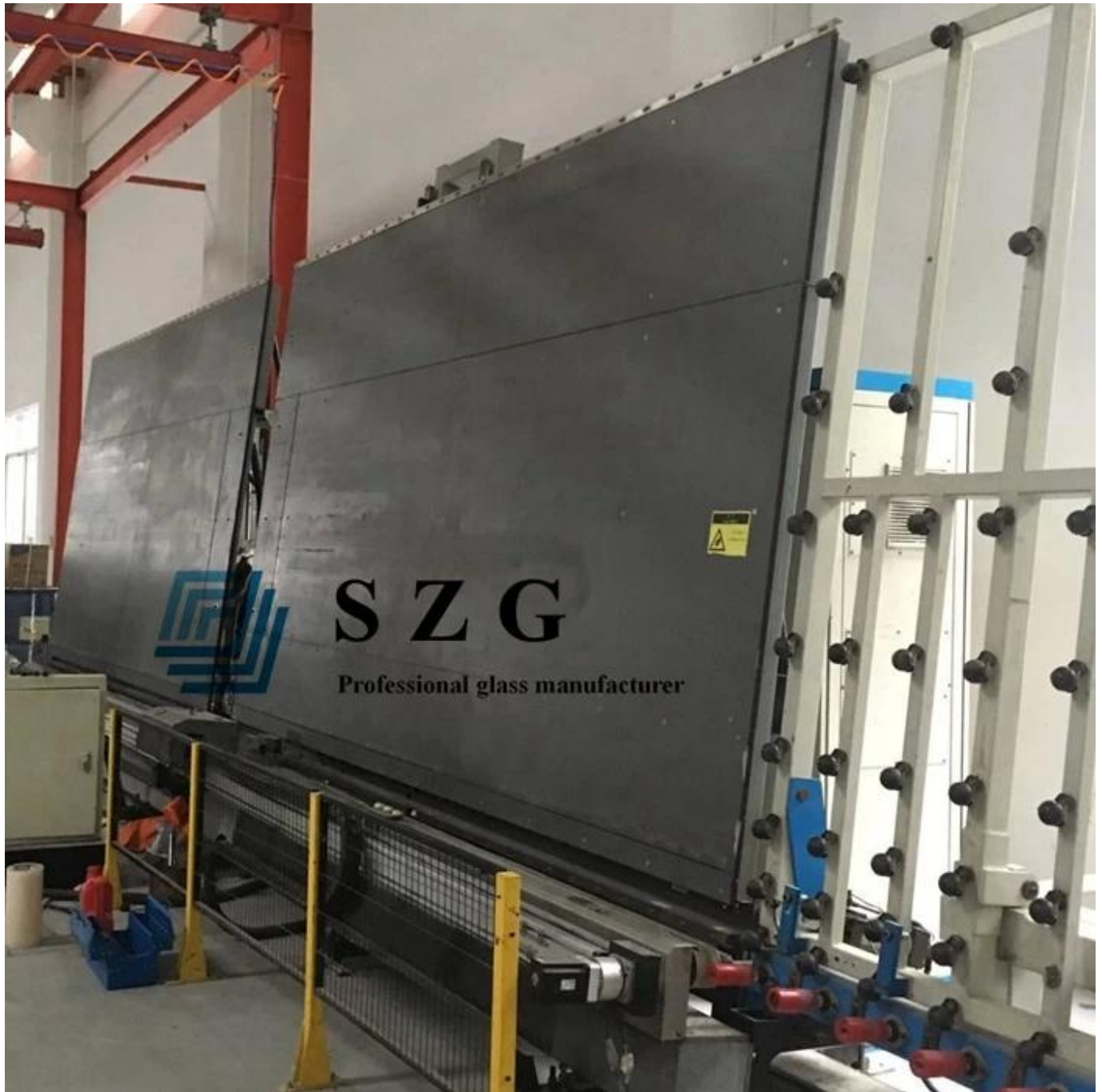
Package and Loading of facade glass: