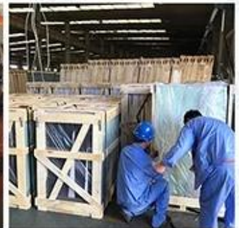
Packing & Loading