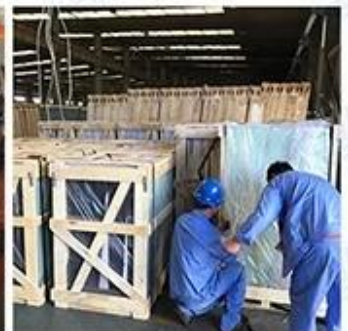
Packing & Loading