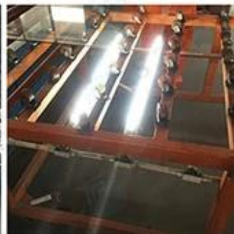
LED Lighting Detection