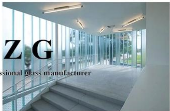
7mm u-profile tempered glass product line