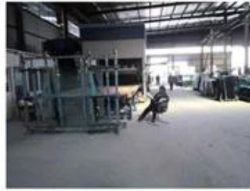
High-pressure & Cleaning