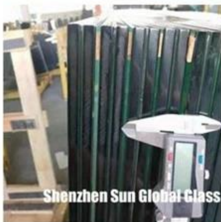
Shenzhen Sun Global Glass