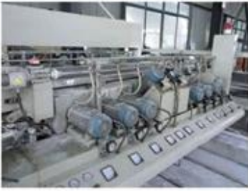
4 Sides Fine Polishing