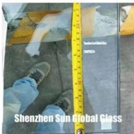
Shenzhen Sun Global Glass