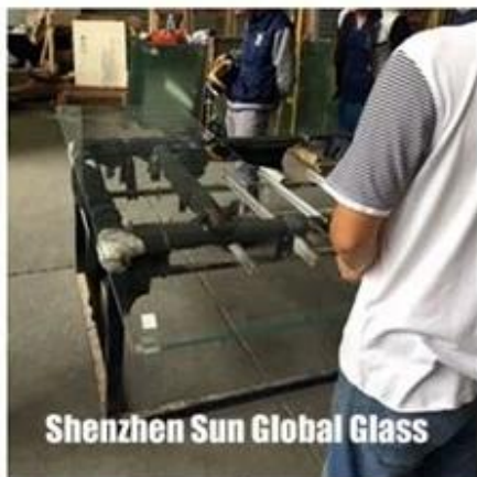
Shenzhen Sun Global Glass