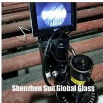
Shenzhen Sun Global Glass