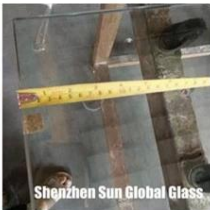
Shenzhen Sun Global Glass