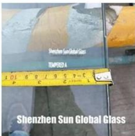
Shenzhen Sun Global Glass