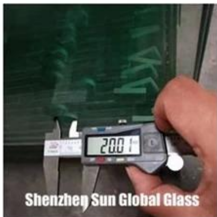
Shenzhen Sun Global Glass