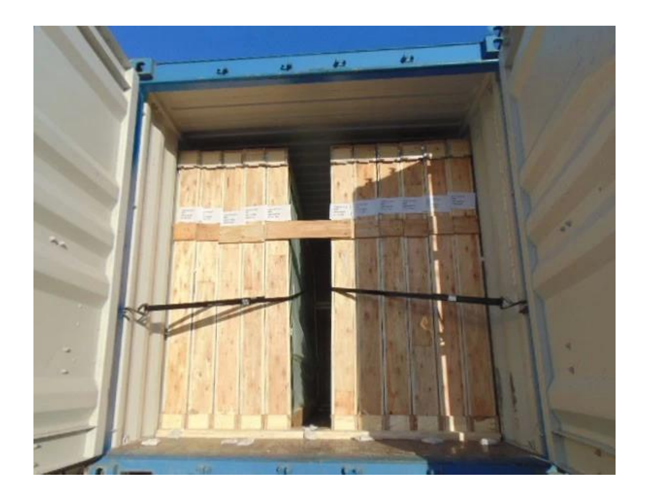
We provide the highest standard 8 mm clear float glass plates to meet the Setup and processing \,