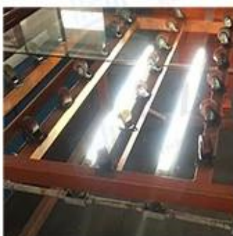
LED Lighting Detection