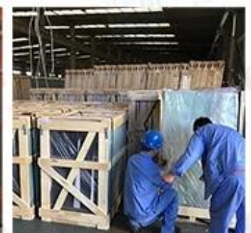
Packing & Loading