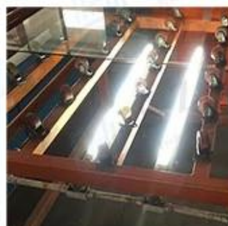
LED Lighting Detection