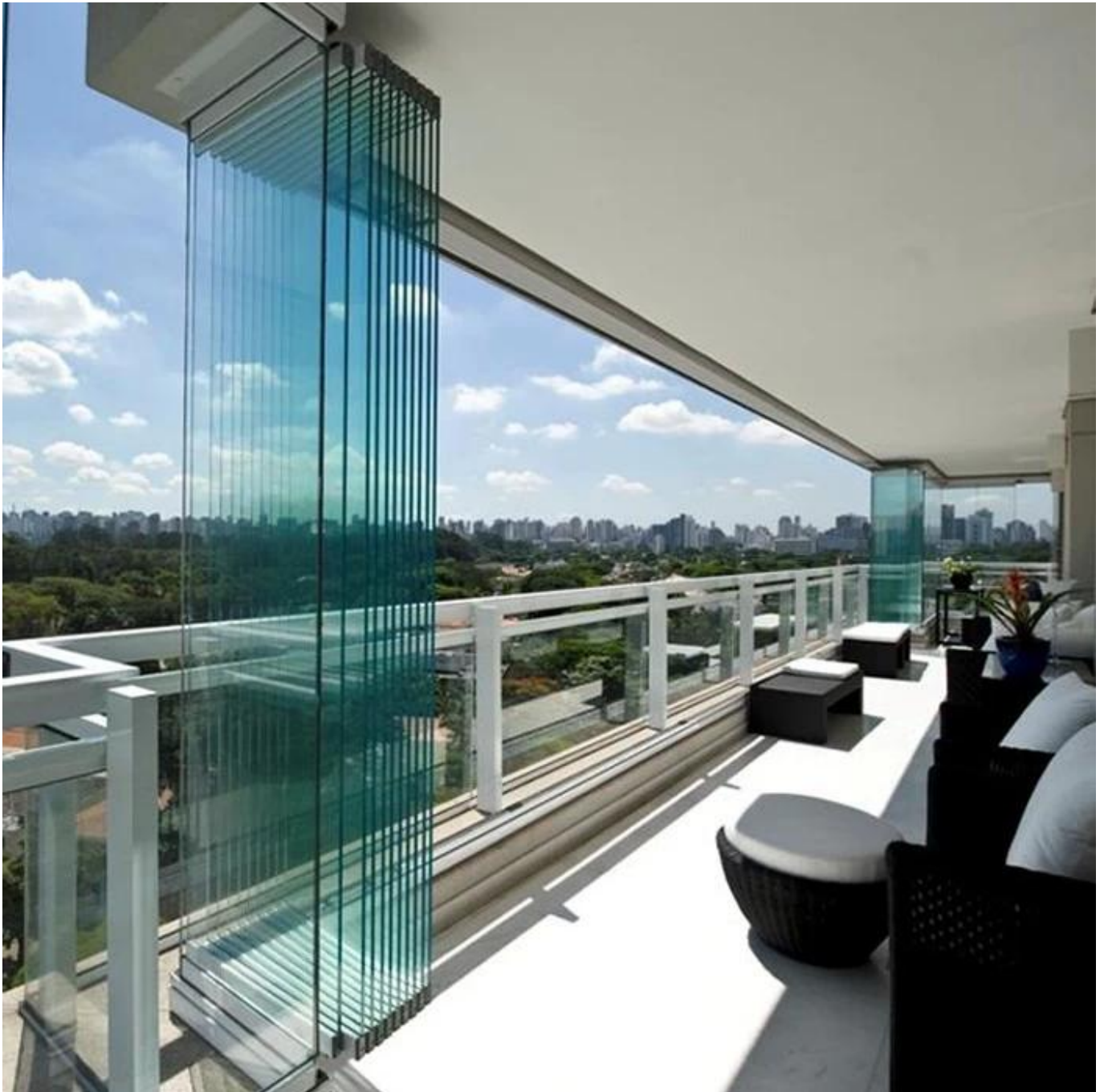
Glass for folding sliding door: