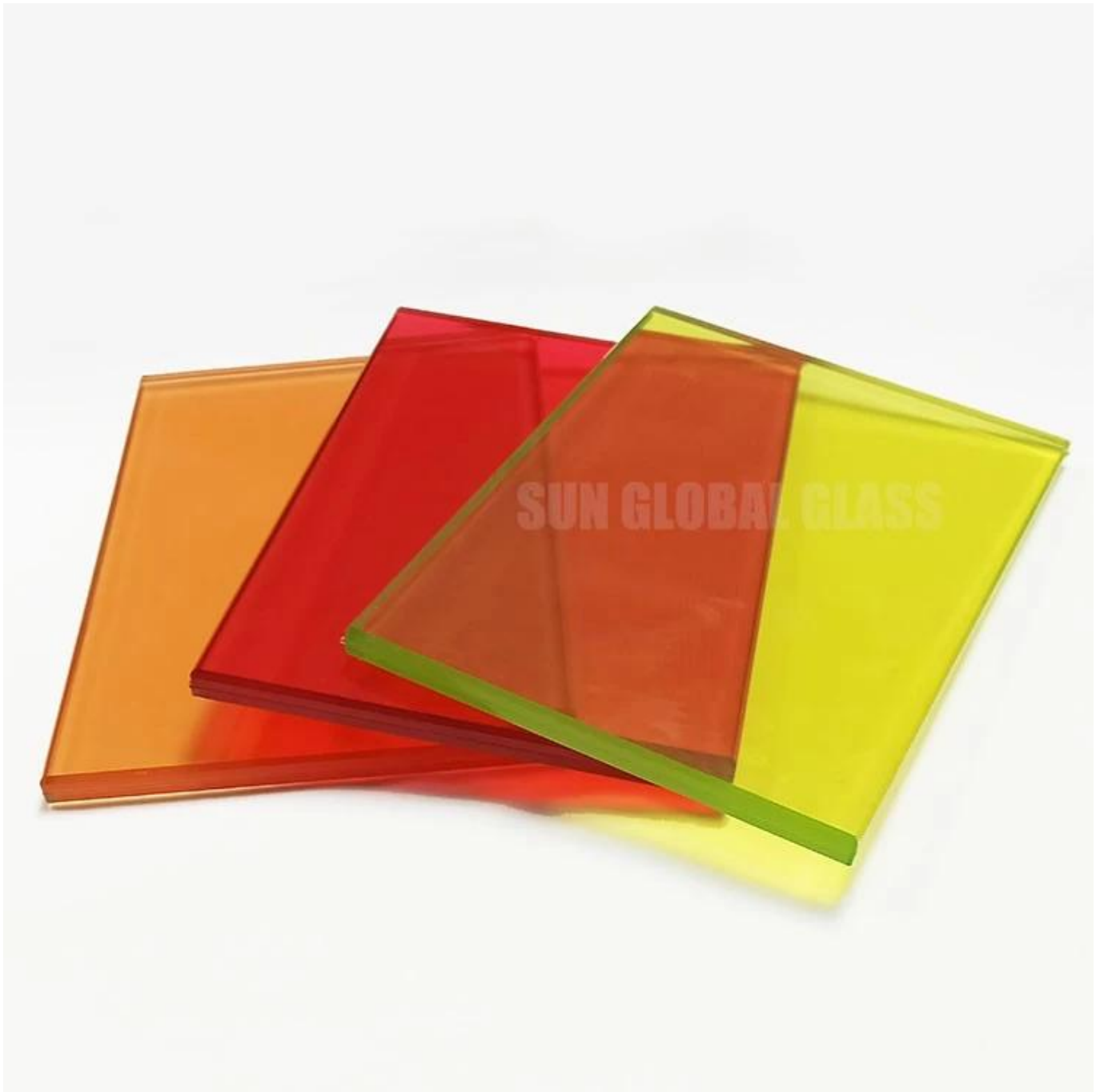
Application of colored tempered laminated glass