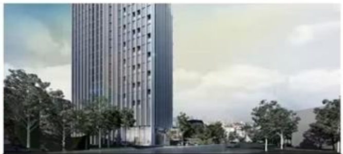
Commercial Office Building