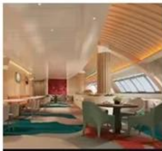
Vehicle & Boat