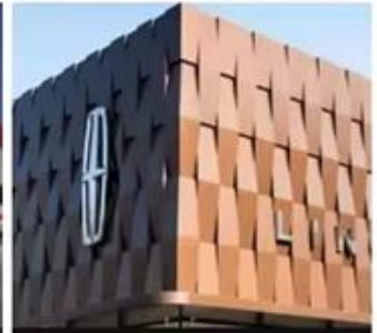
Automobile 4S Projects