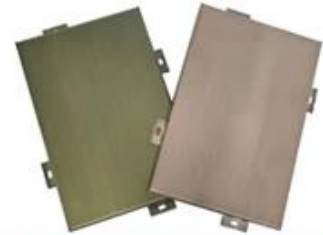
Copper Aluminium Veneer