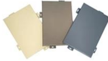
Ordinary Powder Aluminum Veneer