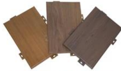
Wood Grain Aluminium Veneer