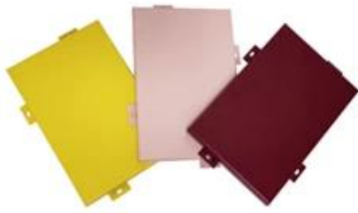
Fluorocarbon Aluminum Veneer