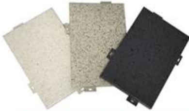
Stone Grain Aluminum Veneer