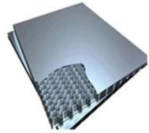
Aluminium Honeycomb Veneer