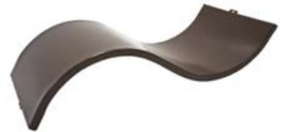
Hyperboloid Aluminum Veneer