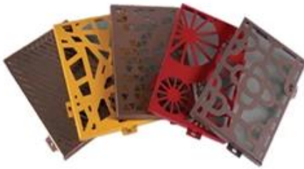
Engraved Hollow Aluminum Panel