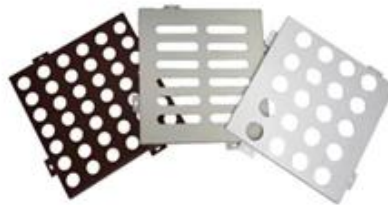
Punched Aluminum Veneer