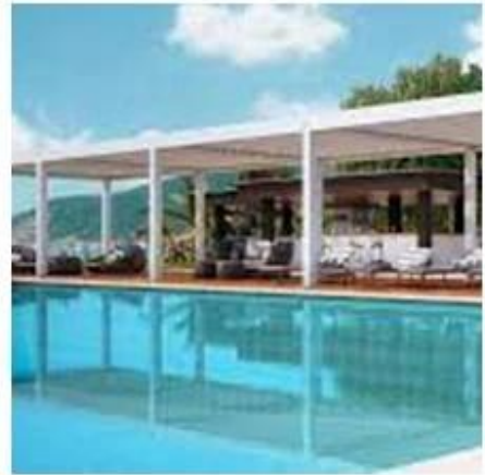
Details of Louvered Roof Pergola