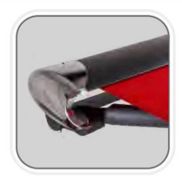
The back cassette can move up and down, it can adjust the height automatically when retracting.when it close, the front bar suit the back cassette exactly.