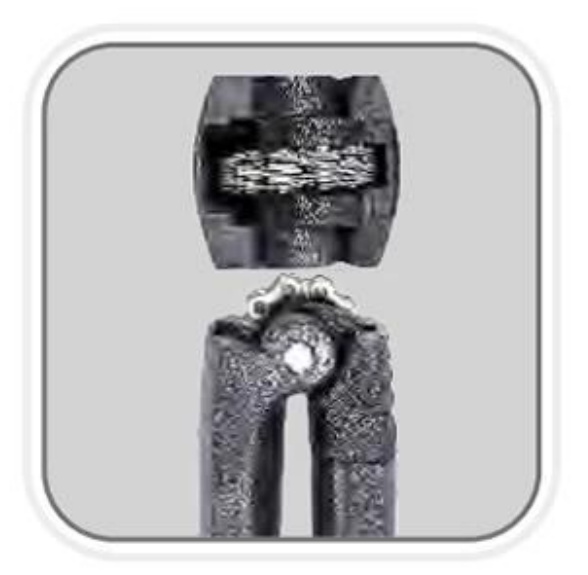
Special-shape arm increase its strength and intensity, arm is made of 304 stainless steel chain instead of steel wire, it become more durable.