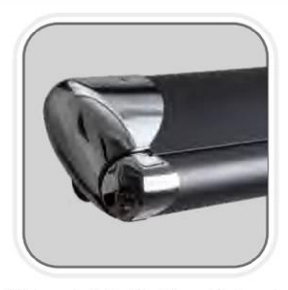
Chrome plated is the metal coating on the surface to change nature of the materials, improve its hardness, prevent wearing, resist heat to keep the surface elegant.