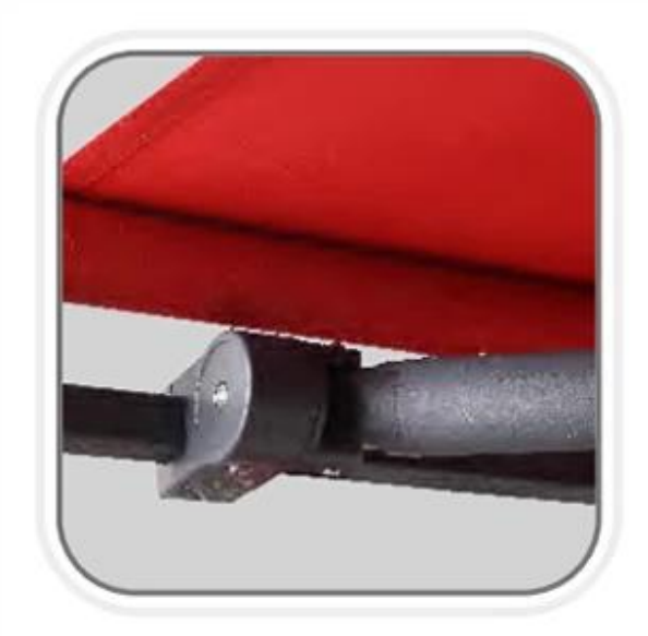
Close-in style adjuster for up and down, it change the traditional adjusting way of exposing the screws. makes adjusting more flexible and stable.