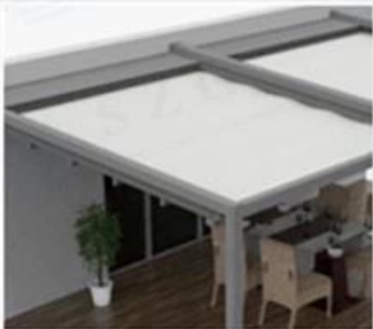
Free Standing&Wall Mounted