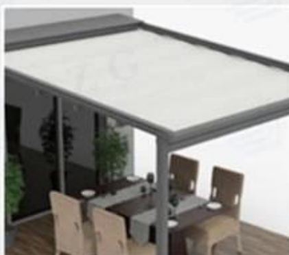
Free Standing&Wall Mounted