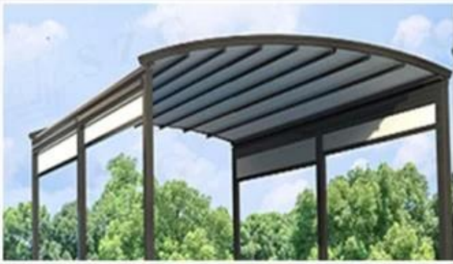
Free Standing(Cruved Roof)