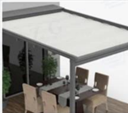
Free Standing&Wall Mounted