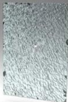
Fully Tempered Glass

Resistant to breakage, 2X as strong as annealed glass, breaks in large shards.